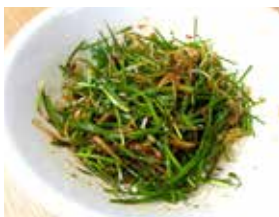
Spicy Seasoned Spring Onions