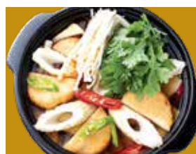
S17. Fish Cake Soup