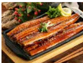
A20. Grilled Eel