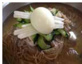
N4. Korean Style Cold Noodle Soup