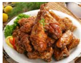
Y4. Deep Fried Crispy Chicken with Korean Style Soy Garlic Sauce