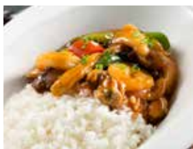
R12. Mixed Seafood with Rice