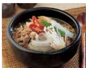
S13. Bulgogi Hot Pot