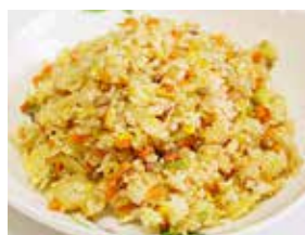
R16. Fried Egg Rice