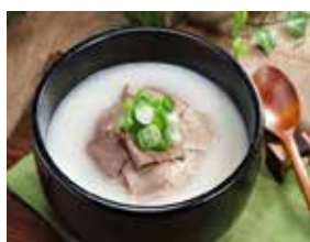
S12. Beef Soup