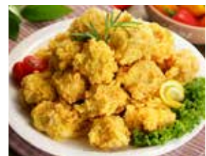
Y5. Deep Fried Boneless Crispy Chicken