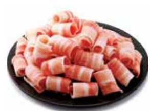
B8A. Thin Sliced Pork Belly

LS(Lunch special) will not be applied on Saturday, Sunday and Public holidays.