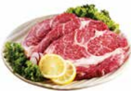
B3. Fresh Ribeye