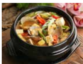
S2. Soybean Paste Stew