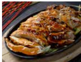
R7. Grilled Chicken Teriyaki with Rice