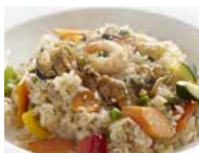
R15. Fried Mixed Seafood Rice