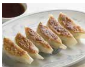
A10. Dumpling (Pork or Veg)