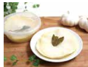
Sliced Radish Pickle