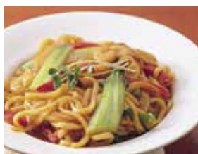
N1. Stir Fried Udong