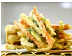
A16. Mixed Vegetables Tempura