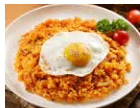
R14. Fried Kimchi Rice