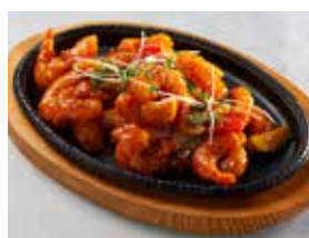
A22. Stir Fried Prawn