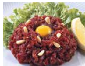
Y10. Sliced Raw Beef (Yuk Hoe)