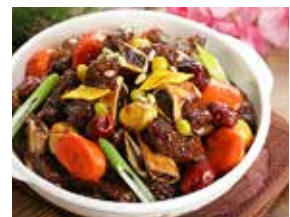
Y13. Steamed Beef Ribs

If you have a food allergy or intolerance, Please speak to a member of the team before ordering. 10% Service charge will be added to the final bill at your discretion.