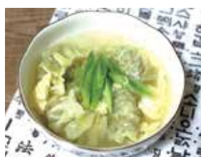
S19. Dumpling Soup