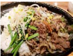
R5. Marinated Beef with Rice