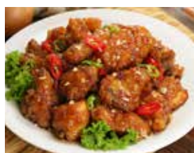
A6. Gganpoonggi (chicken)