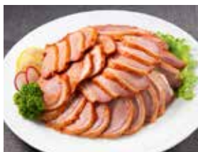
A19. Smoked Duck