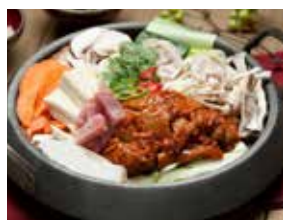
S20. Kimchi Jeongol