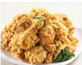
Y1. Deep Fried Crispy Chicken