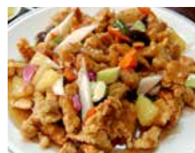
A7. Sweet and Sour Dishes (pork)