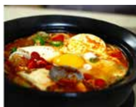
S3. Spicy Soft Tofu Stew