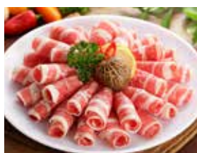
B4. Beef Brisket Point