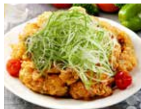
Y9. Deep Fried Boneless Crispy Chicken with Sliced Spring Onion and Honey Mustard Sauce