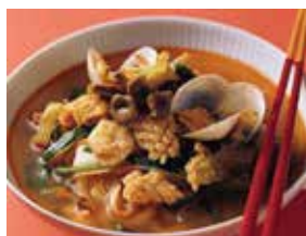
N7. Spicy Mixed Seafood Noodle