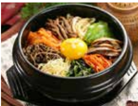
R1. Bibimbab in Hot Stone Pot