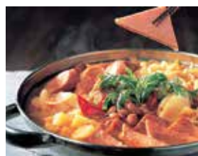
S21. Budae jjigae