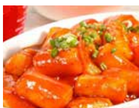
A9. Spicy Rice Cake