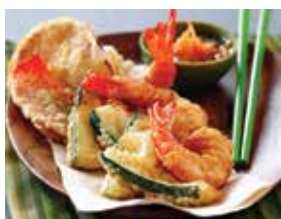
A17. Mixed Tempura