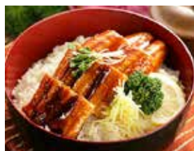
R13. Grilled Eel with Rice