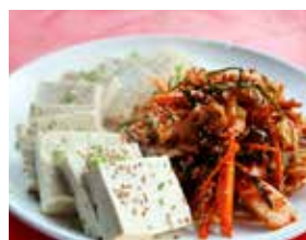
A18. Tofu Kimchi