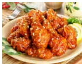
Y2. Deep Fried Crispy Chicken with Korean Style Sweet & Spicy Sauce