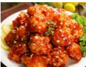
Y6. Deep Fried Boneless Crispy Chicken with Korean Style Sweet & Spicy Sauce