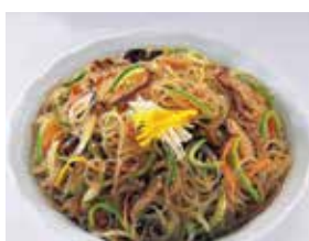
A8. Fried Glass Noodles