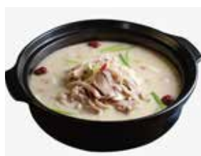
S16. Lamb Soup