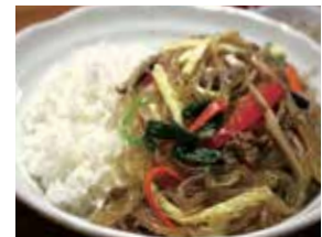
R10. Stir Fried Glass Noddle with Rice

LS(Lunch special) will not be applied on Saturday, Sunday and Public holidays.