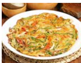
A3. Seafood Pancake