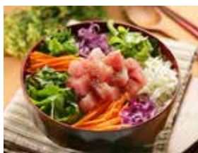
R11. Raw Salmon with Rice