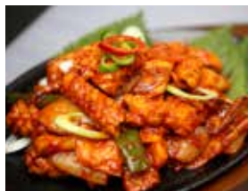
R9. Spicy Calamari with Rice