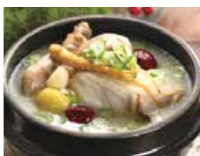
S15. Ginseng Chicken Soup