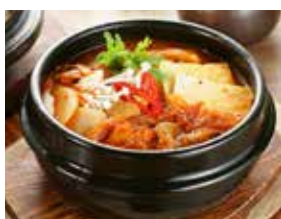
S1. Kimchi Stew