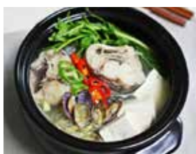
S9. Cod Soup