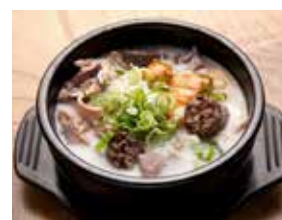
S14. Sundae Soup

LS(Lunch special) will not be applied on Saturday, Sunday and Public holidays.