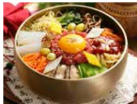
R2. Bibimbab(with raw beef)