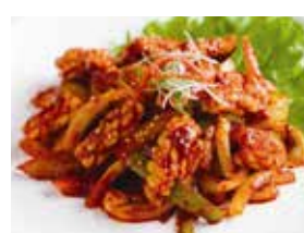
A23. Stir Fried Calamari

If you have a food allergy or intolerance, Please speak to a member of the team before ordering. 10% Service charge will be added to the final bill at your discretion.