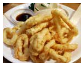
A11. Calamari Tempura

LS(Lunch special) will not be applied on Saturday, Sunday and Public holidays.