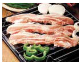
B8. Pork Belly