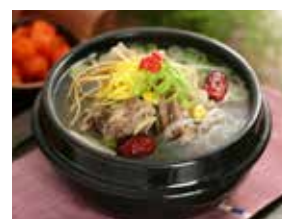
S5. Beef Short Rib Soup