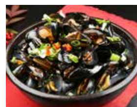
S18. Mussel Soup