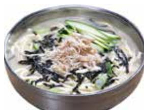
N9. Chicken Flat Noodle