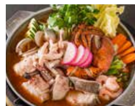
S22. Seafood Jeongol

If you have a food allergy or intolerance, Please speak to a member of the team before ordering. 10% Service charge will be added to the final bill at your discretion.