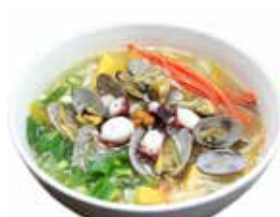
N8. Mixed Seafood Flat Noodle

LS(Lunch special) will not be applied on Saturday, Sunday and Public holidays.