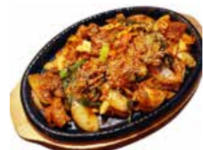
R4. Spicy Pork with Rice